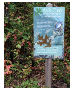
Possible Types of Signage at Exhibits Along the Trail